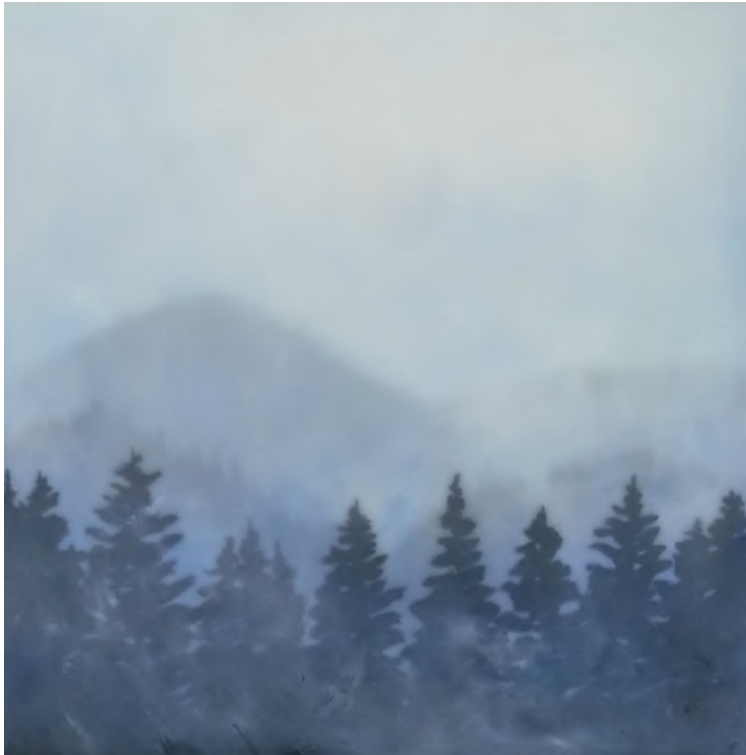
Ultra Hills Study