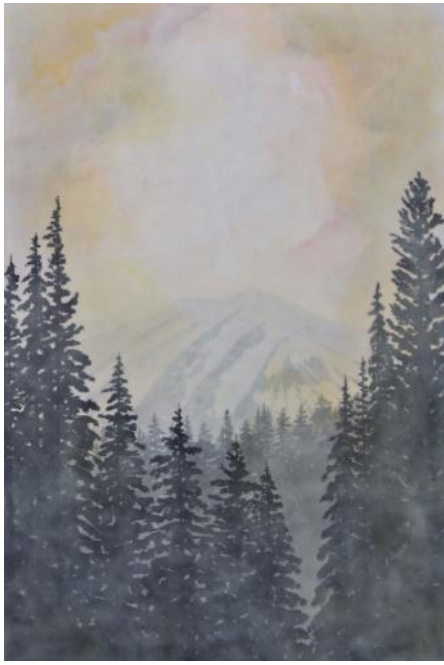
Practice of Allowing