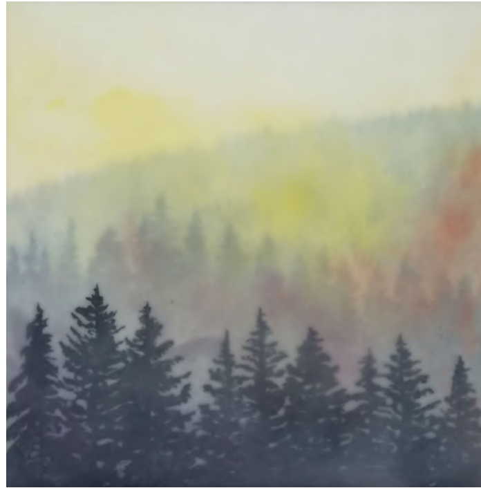
Happy Little Study