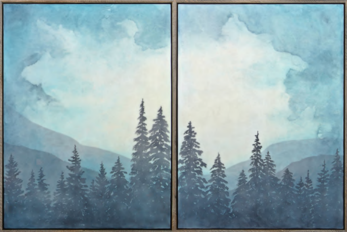
Ebb & Flow

My encaustic process begins with time spent outdoors - hiking, skiing, biking, observing. Taking that inspiration, I develop ideas and compositions further with sketches and watercolor studies to take what I have seen and view it through my own distinct lens before turning that vision into an encaustic painting. The paintings are not photo realistic, but a discretized representation of a simpler world. Using natural ingredients like beeswax, tree resin and milk paint, I distill a landscape down into bare elements - a mountain, a ridgeline, a stand of trees, a wisp of fog. A slice of landscape frozen in time. Nature is far too complex to understand it wholly at once, but by collapsing thousands of trees into one element we can begin to appreciate her more fully.